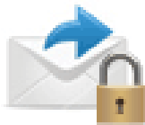
E-mail Signatures & Encryption